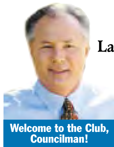
Welcome to the Club, Councilman!