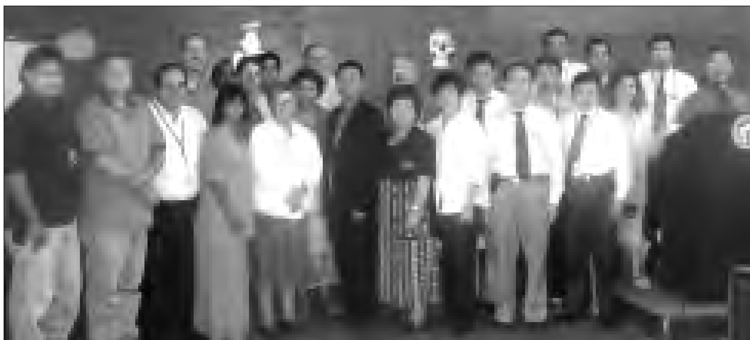
The awardees present at the ITA ESB Awards Luncheon.