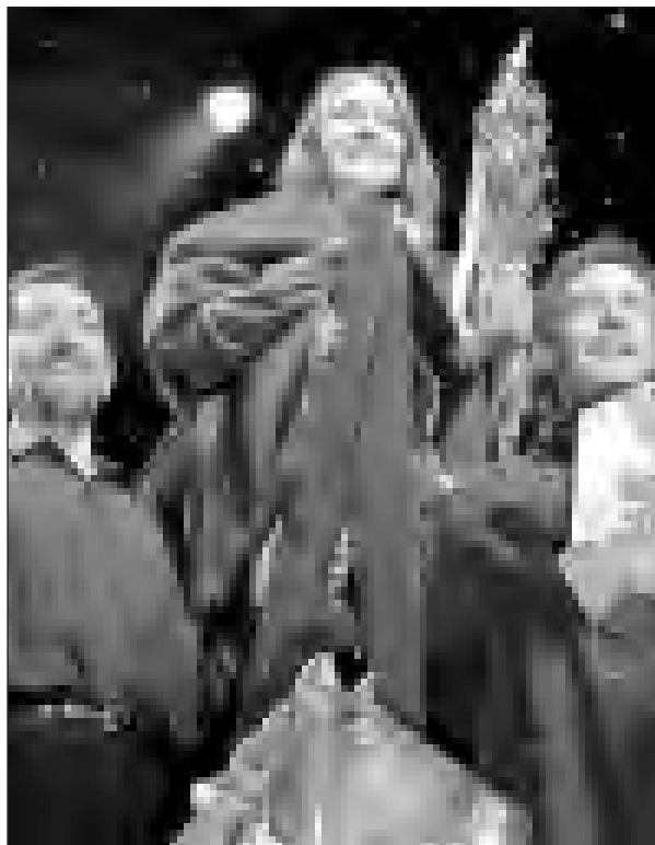
A Noise Within's current holiday production, "A Wilde Holiday."

The mission of A Noise Within is to perform great works of world drama in rotating repertory with a company of professional, classically trained actors and to educate the public through comprehensive outreach efforts and conservatory training programs which foster an appreciation for and understanding of these great works.