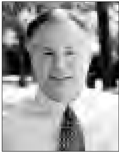
by Tom LaBonge, Councilmember, 4 th District