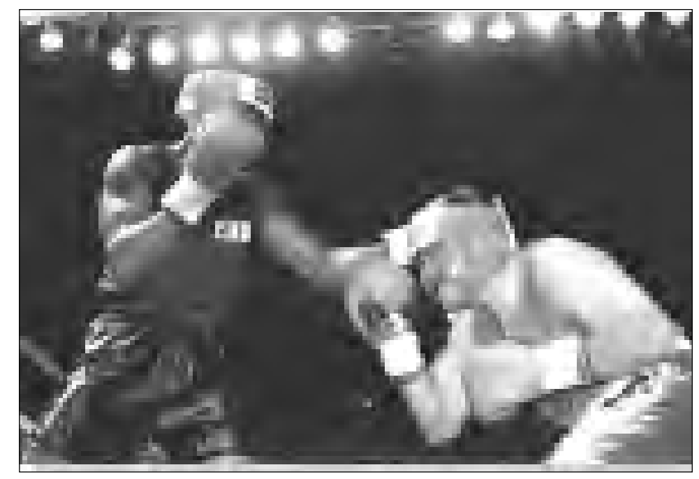
The LAPD and LAFD square off in the first bout of the night at last year's event.

Tickets for the event can be purchased at the Grand Olympic box office or at TicketMaster outlets, with tickets ranging