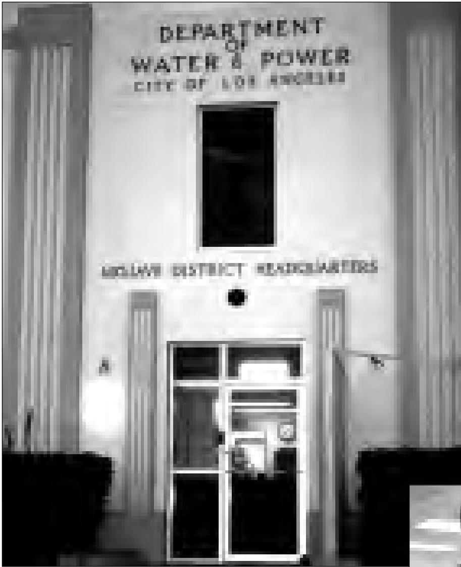
The DWP Mojave office.

■ City employee family extends far beyond the City, so the Club goes to them. Second in a series.