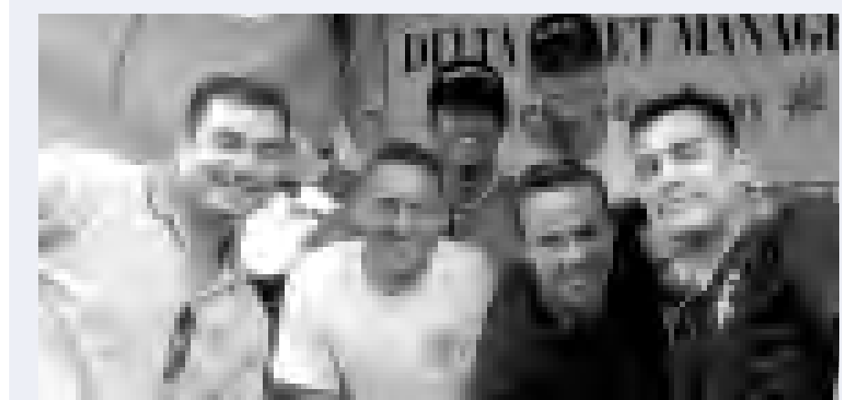
The Club was happy to join with the firefighters from Station 11 as they participate in the Fireman's Cookoff. Proceeds went to charity.