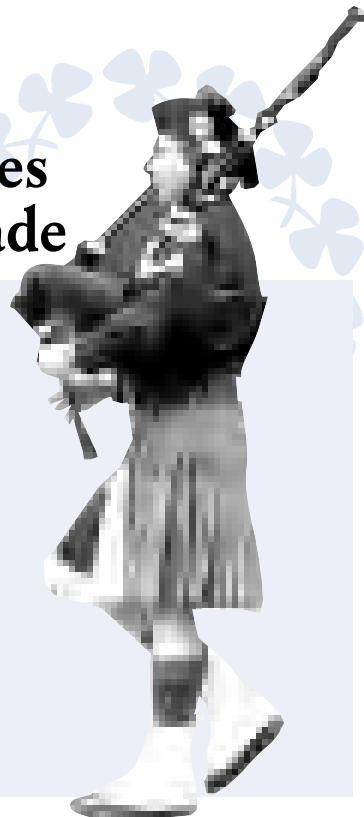
In March, the Club went along as the City celebrated St. Patrick's Day with a grand parade.