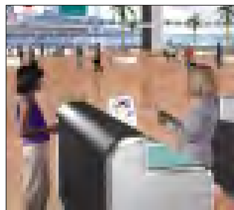
Artist's rendering of the proposed Central Terminal Area.

■ Proposed plan to guide LAX well into the future is open to comments, but only until Nov. 7. Make your voice heard.