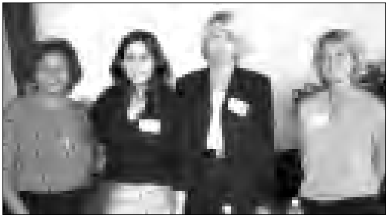
Los Angeles Police Relief