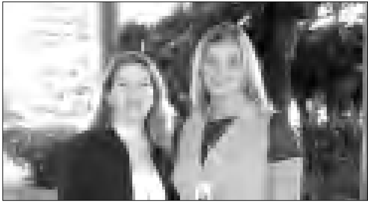
LAPD Federal Credit Union