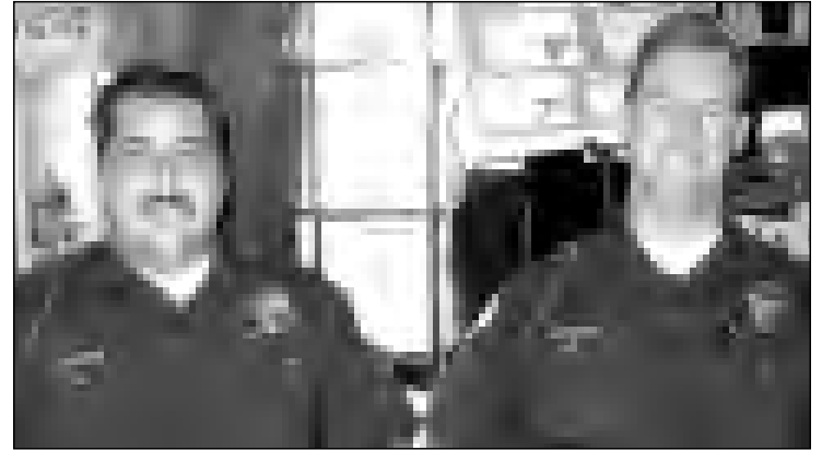
LAPD Central Station