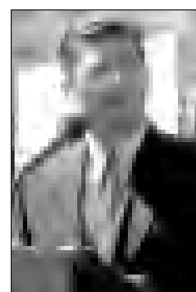
U.S. Congressman Xavier Becerra