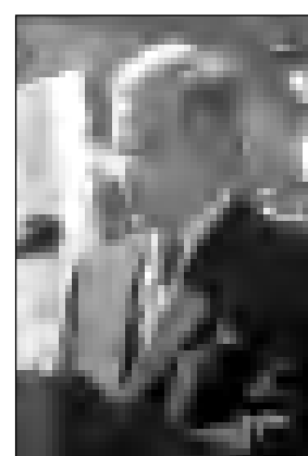
Representative from the Fire Commission