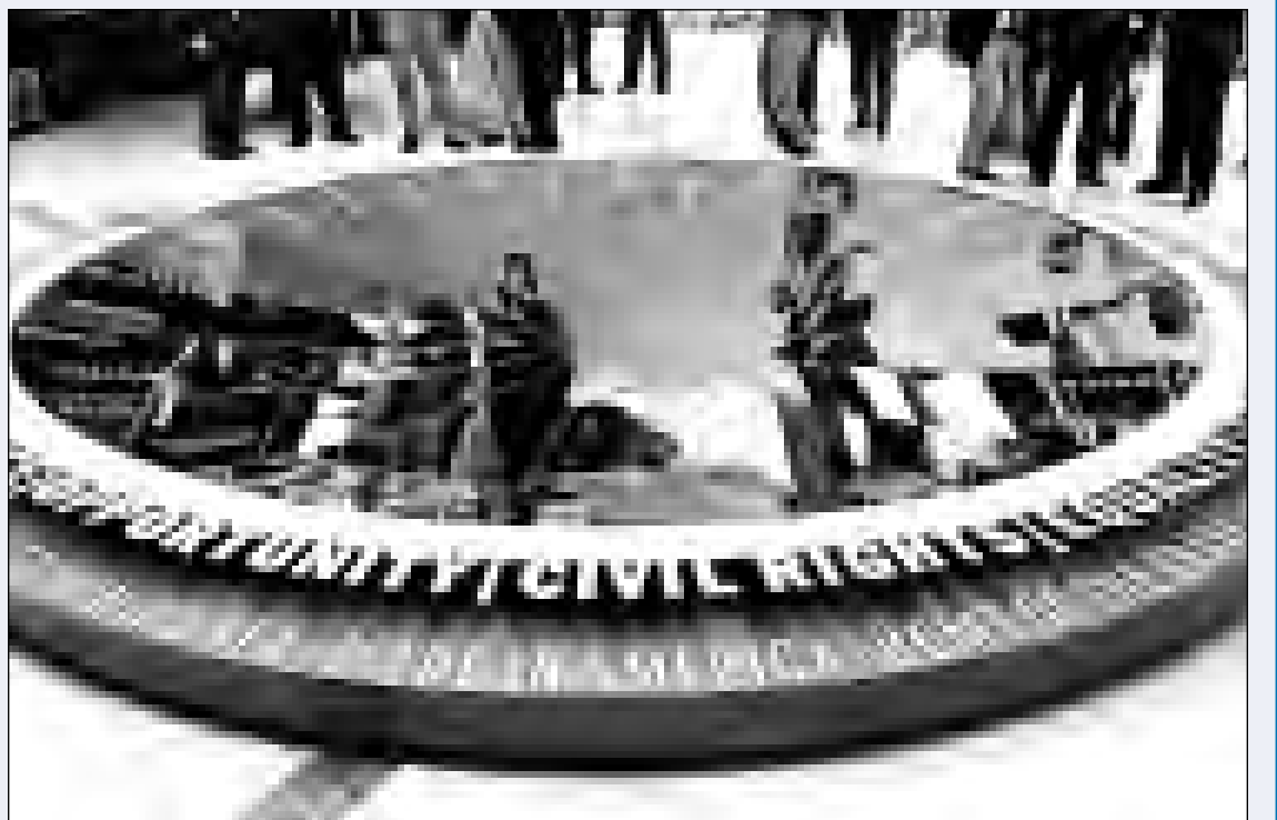
Recovering Equilibrium, at LAX.

"The text in this art piece came from thoughts and ideas from community members in our surrounding airport areas and I thank those who participated and provided their valued input," Day added.