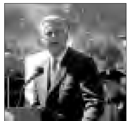
Mayor James Hahn