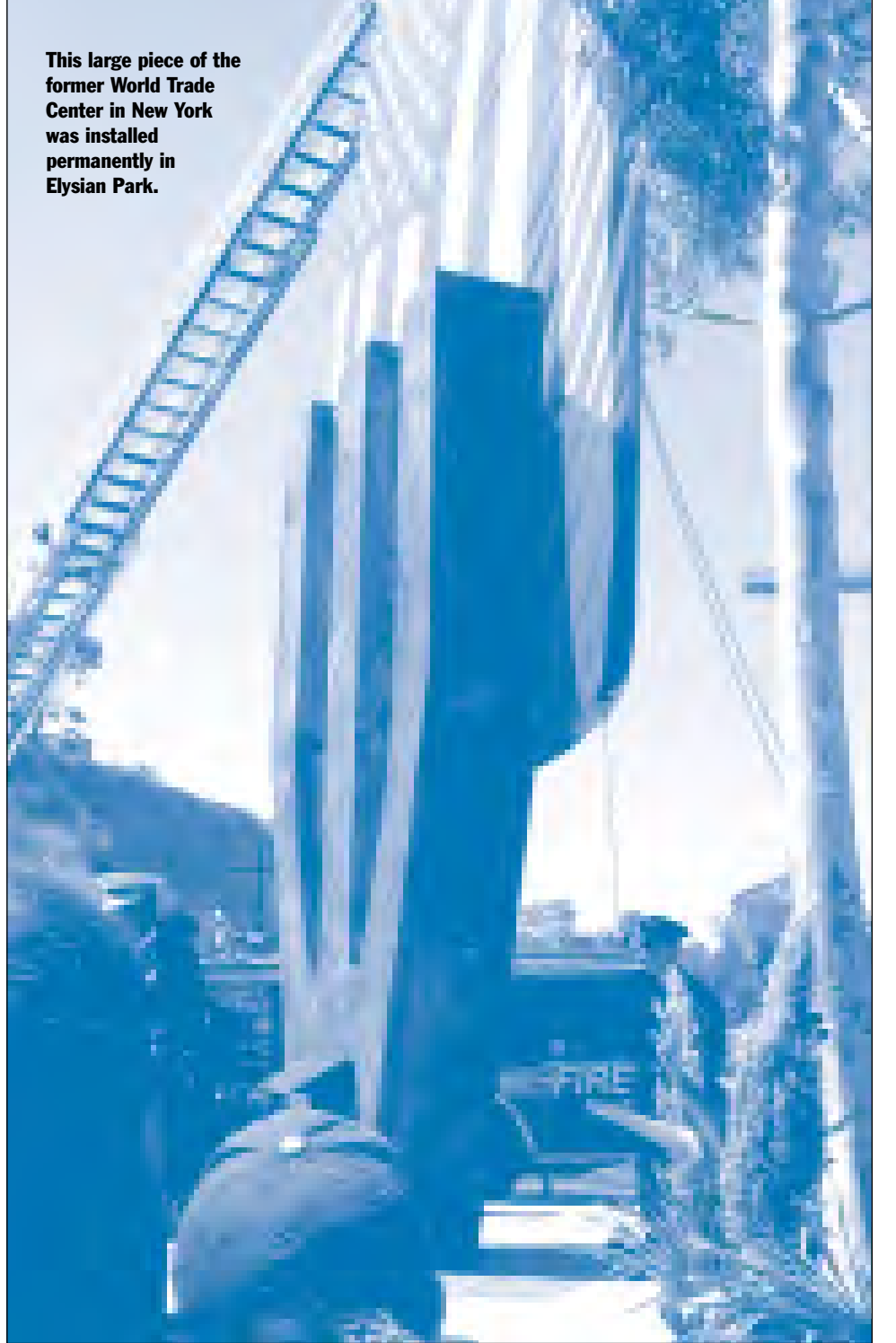
This large piece of the former World Trade Center in New York was installed permanently in Elysian Park.

The LAFD paid tribute to their fallen FDNY brethren on Sept. 11, 2003, two years after the terrorist attacks. A plaque (page 14) was installed in Elysian Park on an actual piece of the World Trade Center. A succession of dignitaries (page 14, bottom) paid official tribute.