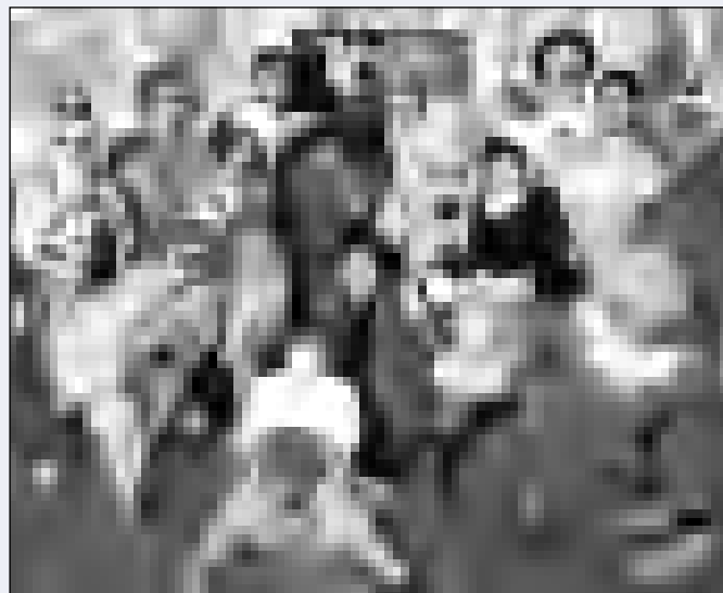
The DWP Choraliers in costume for "The Circus Is a Wacky World."