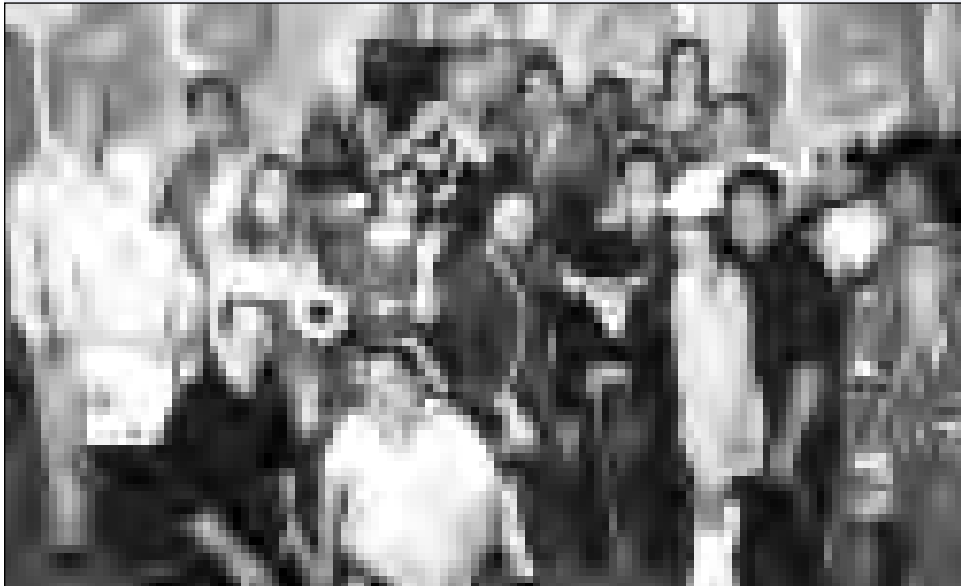
The DWP Choraliers in costume for "Sugar, Sugar."

Alive! and the Club salute the Choraliers for the joy they bring City employees! 🎭