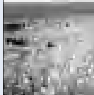
White Point Nature Preserve