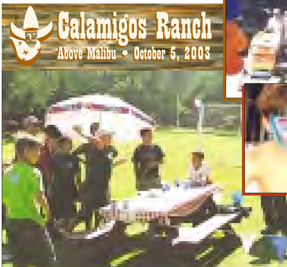
Plenty to see and do at Calamigos Ranch including games, hayrides and face painting.

■ Fresh air, good food and a space as big as the great outdoors await you at the second annual Club family party. It's members only, so say goodbye to last year's large crowds. Register early!