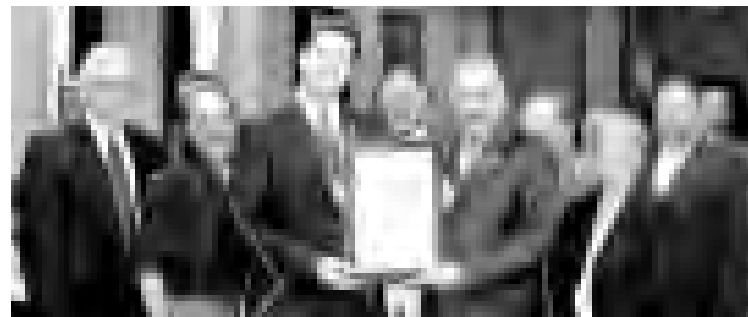
The Aqueduct Power Plant Section

From June 5 to 7, 2002, approximately two dozen