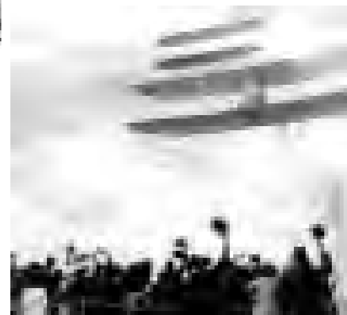
The Van Nuys Expo celebrates the 100 th anniversary of powered flight.

Information, call the Expo Hotline at (866) VNY-EXPO (866 869-3976) or visit www.lawa.org .