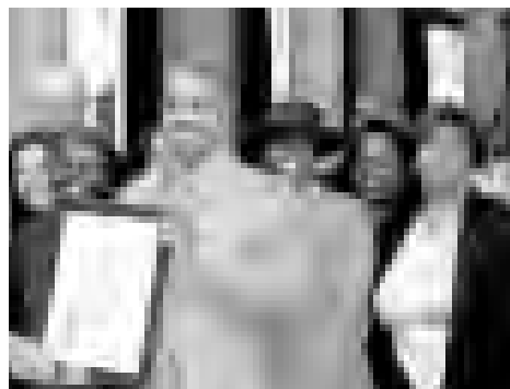
Small Business and Job Opportunities Division