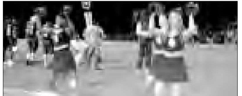
The L.A. Centurions Cheerleaders.