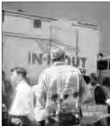
In-n-Out burgers spelled a good day for a good cause.

"I just want to thank everyone who participated," Baptiste said.