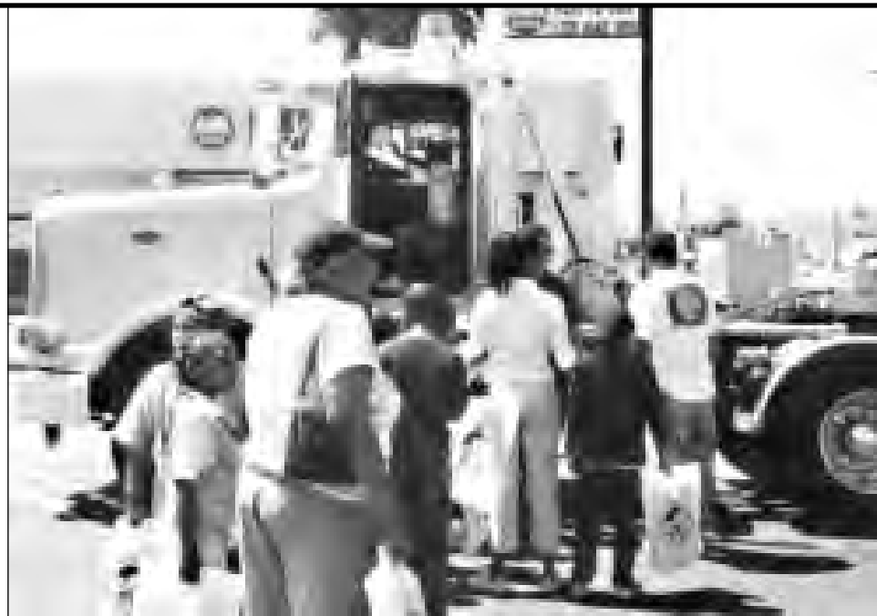
People in line, waiting to board a service vehicle, at a Public Works Week event last year.

Instituted as a public education campaign by the American Public Works Association (APWA) in 1960, NPWW calls attention to the importance of public works in community life. The Week seeks to enhance the prestige of the often—unsung heroes of our society—the professional engineers and administrators who serve the public good every day with