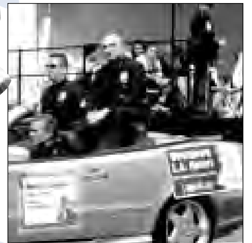
Honorary Grand Marshal, William Bratton, Chief of Police