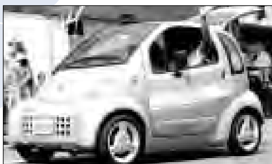
The Department of Water and Power's Electric Car