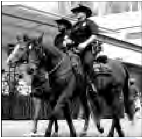
LAPD Equestrian Officers patrolling the parade route