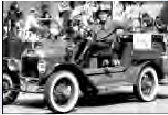
Celebrity Grand Marshal – Rene Russo