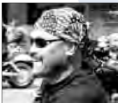
A member of the "Fire Hogs," the LAFD Motorcycle Club