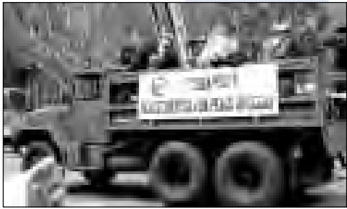
Father Mike's Desert Refuge for Peace Officers