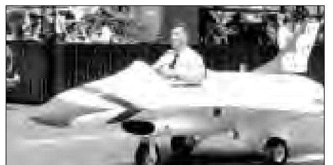
The U.S. Air Force