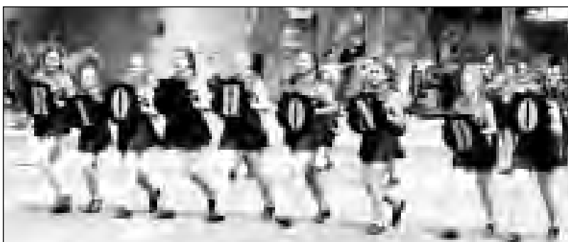
Rio Hondo Preparatory School