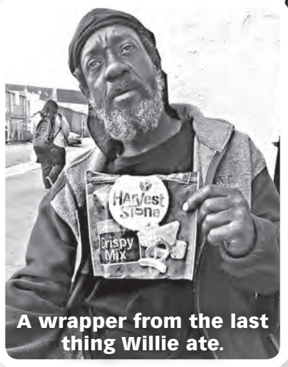
A wrapper from the last thing Willie ate.