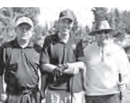
Founder of the Baker to Vegas relay footrace challenge cup,